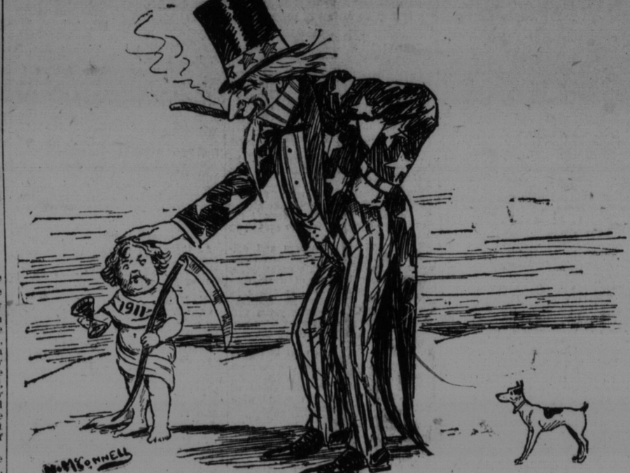
UNCLE SAM—"If you get me reciprocity with Canada, you will be famous in American history."