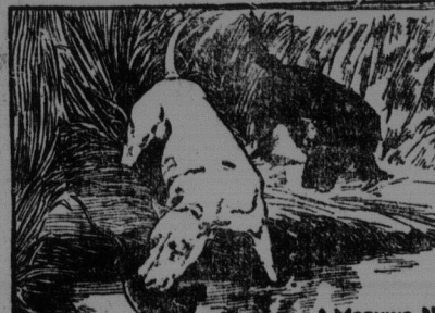
A MORNING NIP