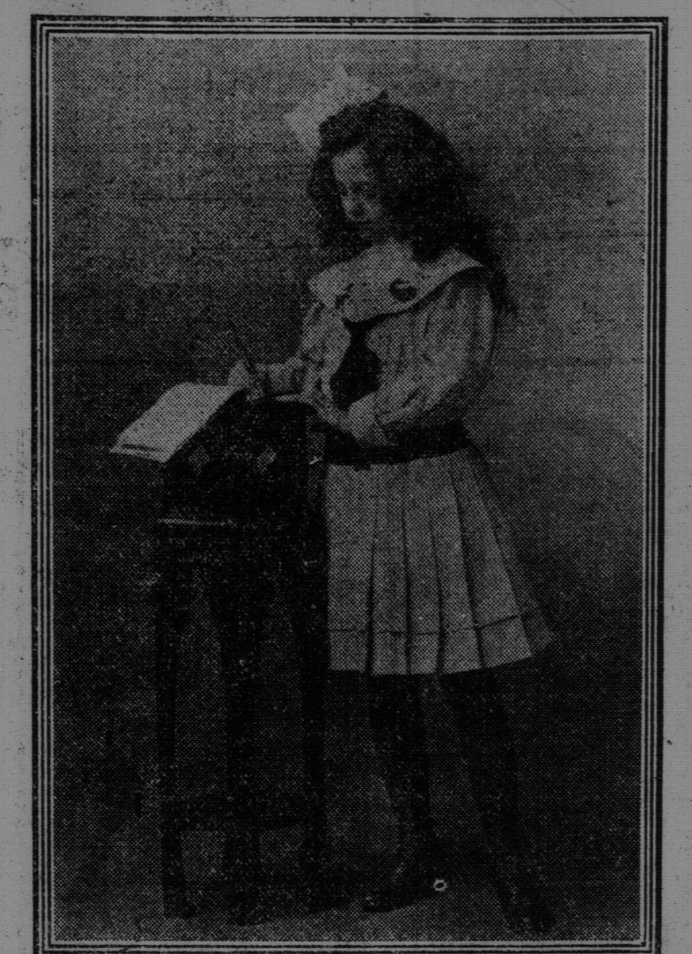
A LITTLE MOHAIR SCHOOL FROCK. The lightweight striped mohair make dainty frocks for the small schoolgirl.