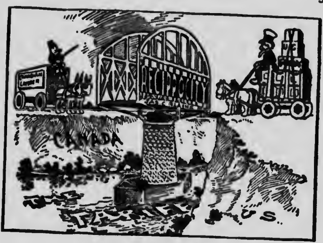
THE OPEN BRIDGE

Apart from these petty bickerings, however, there are certain serious dangers behind the reciprocity movement, dangers which should be clearly considered by Canada. These may or may not be fatal to her best interests. Such a contingency altogether depends upon the character of her people and the influences of reciprocal trade. Many years' residence in the Republic has taught me that, beneath the notions of the average American concerning reciprocity, is the fixed belief that sooner or later, by hook or by crook, Canada must be made an integral part of the Union. The methods for accomplishing such a result may vary. They may be peaceful and benevolent, or they may be predatory and designing. No doubt many patriotic Americans would disavow such a belief or design, but that does not change the prevailing view. That such a feeling exists, and exists very widely, is a fact as susceptible of proof as any phenomenon well can be in the current life of the Republic. One of the common arguments for reciprocity is the supposed ingratiation of the Canadian people, so that they will become en-