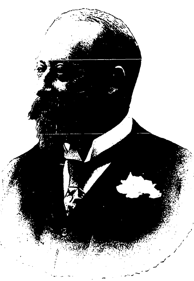
HIS ROYAL HIGHNESS THE PRINCE OF WALES.

Again the bugle sounded, and, while the piano played, a number of little girls bearing flags stepped to the front, and ranging themselves in two lines, facing each other, went through some wonderful performances with their flags, after which the band struck up "Rule Britannia."