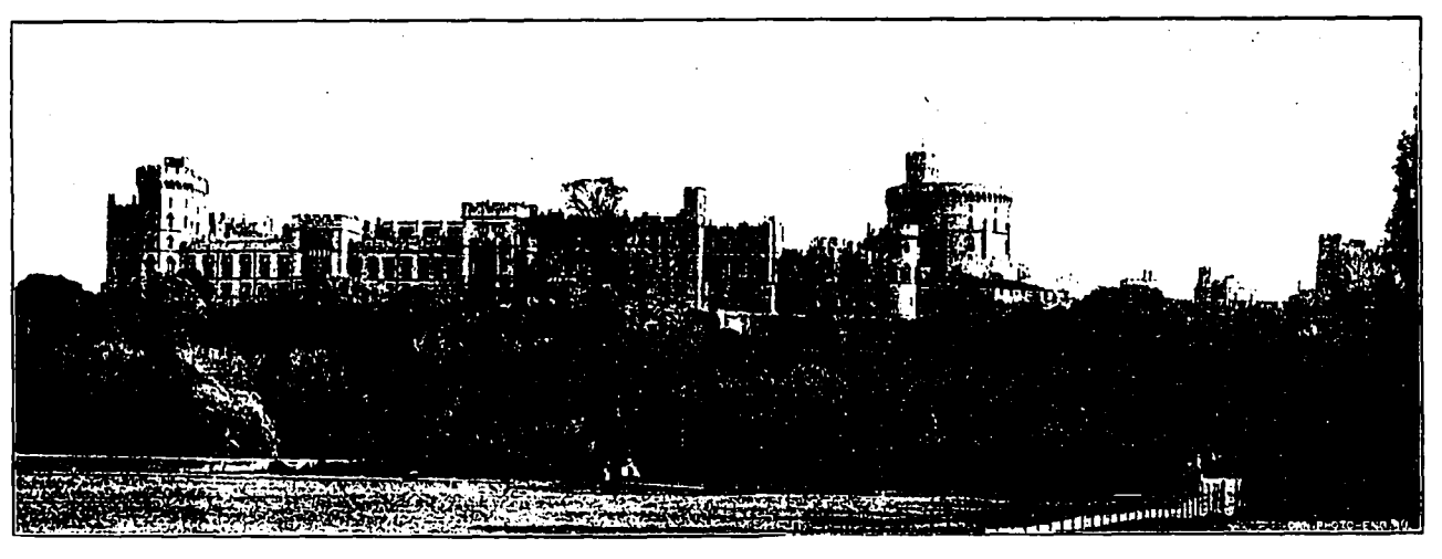
WINDSOR CASTLE FROM THE HOME PARK.

was immensely appreciated. "Babies' Castle," that followed next, was, perhaps, the great success of the evening. The arena was transformed into a huge nursery, where a number of "tinies" disported themselves with rocking horses, wheelbarrows, kittens, and in romping in a huge pile of newly cut grass. The Prince and Princess of Wales were highly delighted with the nursery scene, and two wee children were taken up to the