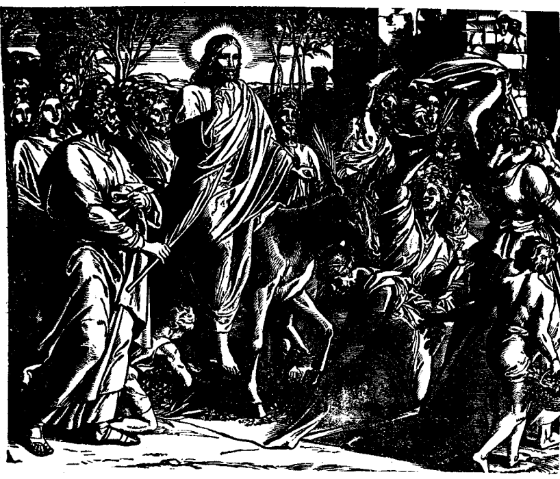
CHRIST ENTERING JERUSALEM.