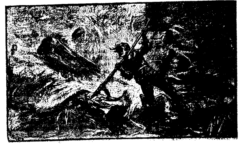
BREAKING A LOG JAM.

But the river drivers did not mind this very much. The hated Black Rapids were passed, and the rest of the Kippewa was comparatively smooth sailing. So, with passed, and the rest of the happens and comparatively smooth sailing. So, with song and joke, they toiled away until all their charges were afloat again and gliding steadily onward toward their goal. Thenceforward they had little interruption in their course: and Frank found the life wonderfully pleasant, drifting idly all day long in rully pleasant, drifting idly all day long in the bonne, and camping at night beside the river, the weather being bright and warm, and delightful all the time. So soon as the Rippewa rolled its burden of ferest speaks out upon the broad bosom of the Ottawa—the Grand River, as those