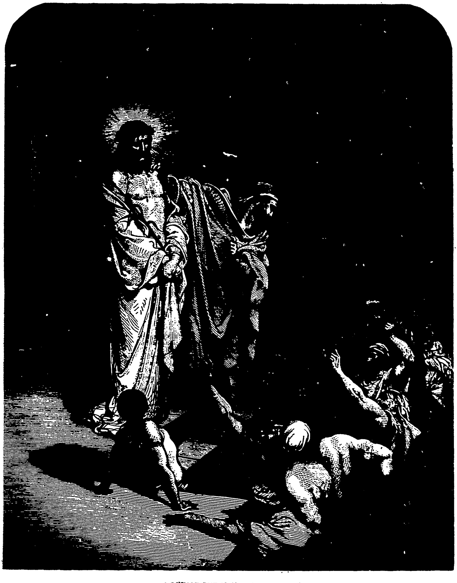
"BEROLD THE MAN."—(San ware sage.)