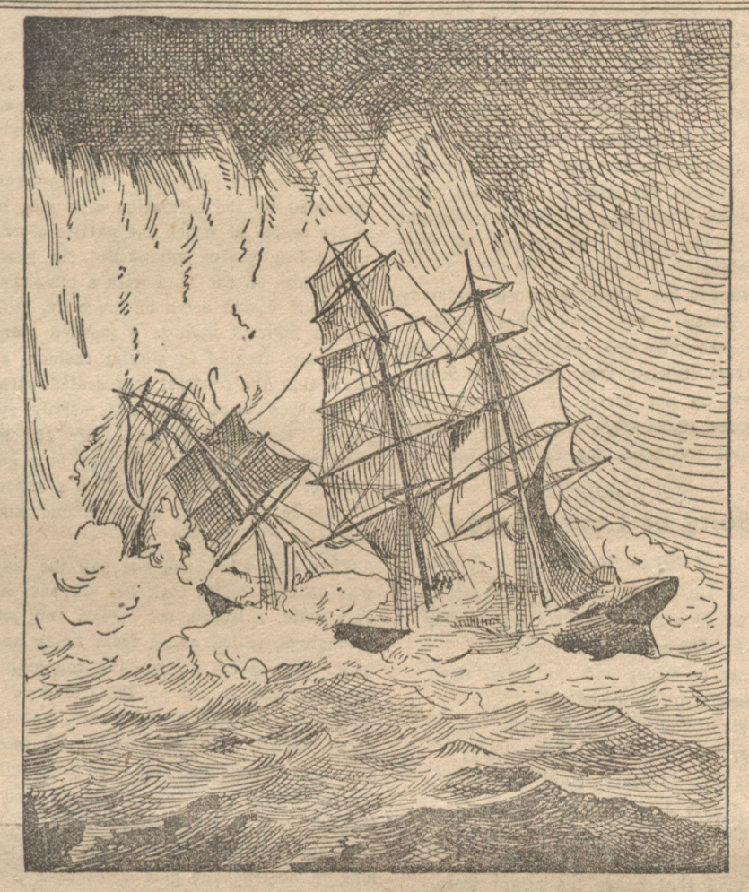
"THERE'S NO CHART FOR ICEBERGS."

*A 'tickle' is a narrow passage to a harbor or between two islands.