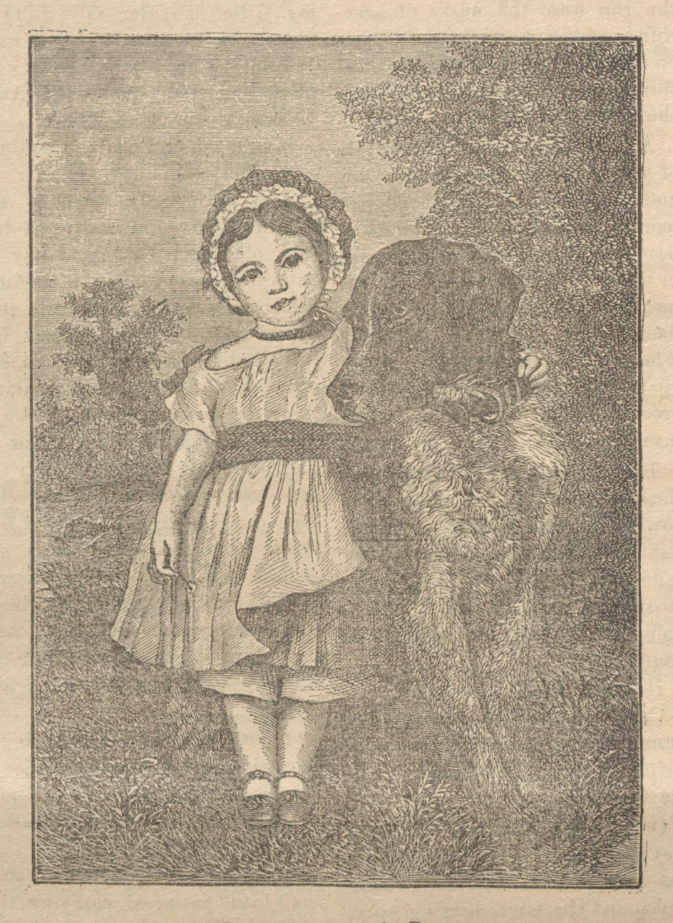
Grandma and Rover.