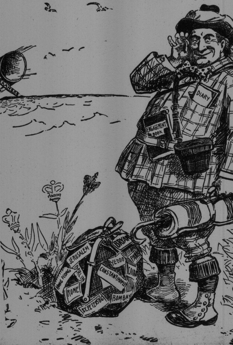
—New York Herald.