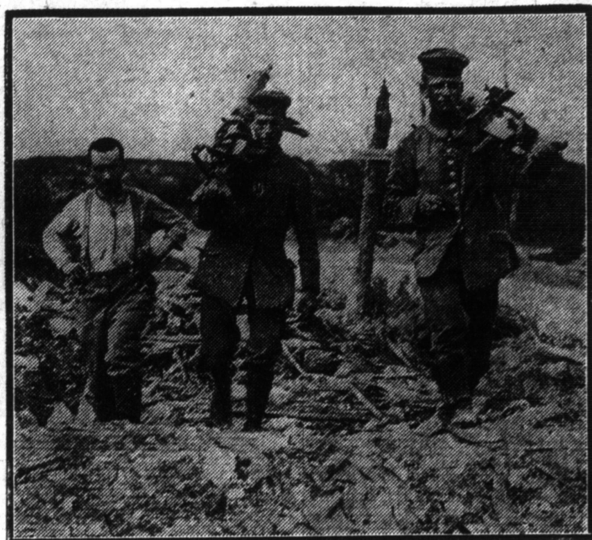
German prisoners, captured by the Canadians, compelled to carry in their own guns, which also were captured.