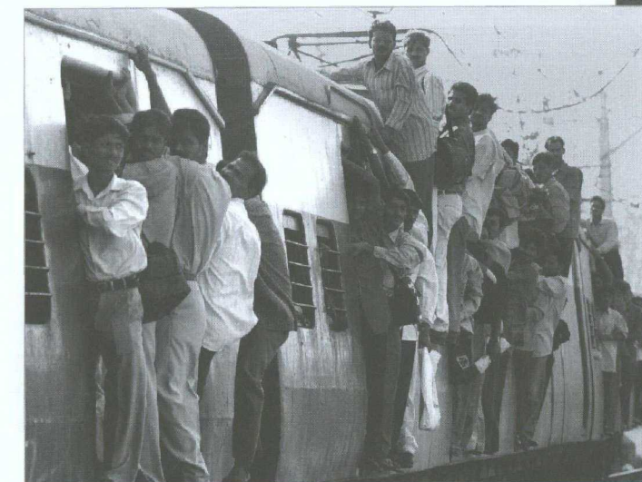
The revamping of India's transport system is still in low gear.

It all adds up. From April to September 2004, for example, India's GDP growth stood at 7%, despite a weather-related drop in agricultural output. According to the Indian Ministry of Statistics and