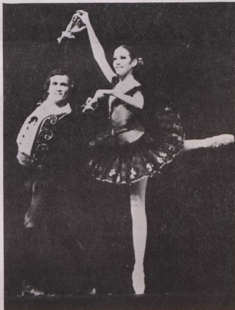
Evelyn Hart and David Peregrine in the pas de deux from Don Quichotte, performed at the competition in Varna.

The competition featured 75 pairs of dancers from around the world. In May, the two dancers won a bronze medal at the World Ballet Concours in Japan.