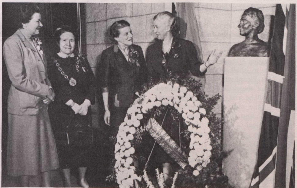
The unveiling in March 1955 at the House of Commons of a bust of Agnes McPhail, the first woman member of Parliament (1921). Left to right: Margaret Aiken, member of Parliament; Charlotte Whitton, mayor of Ottawa; Cairine Wilson, senator; and Ellen Fairclough, Secretary of State.

By the time she retired, Miss Whitton had won numerous awards and honours for her activities in public life. Among these were membership in the Order of the British Empire (1934) and the Order of Canada (1967). Charlotte Whitton died in Ottawa on January 25, 1975.