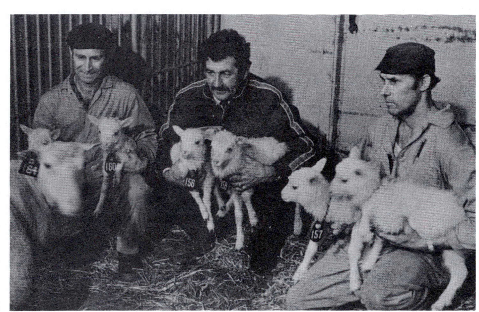
A Finnish ewe broke all local fertility records this spring by giving birth to sextuplets at Laval University's Agricultural Station at St-Augustin near Quebec City. The arrival of the six lambs was another successful step forward in a program of cross-breeding

Limited copies of the report are available from Central Mortgage and Housing Corporation, Head Office, Ottawa, Ontario, Canada.