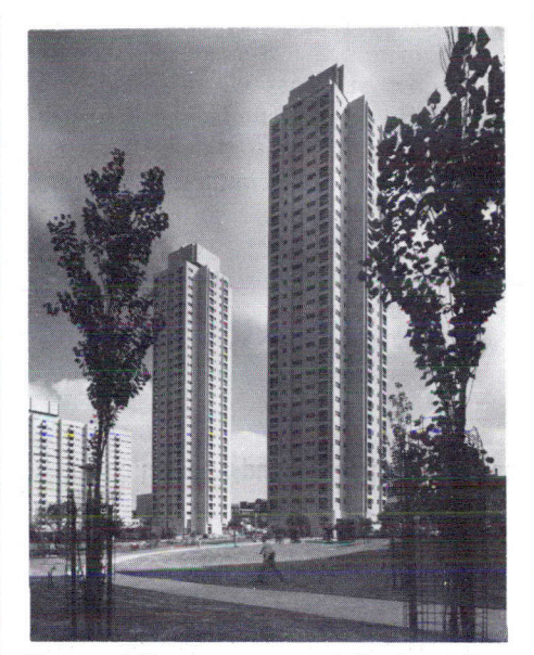
Four public rooms named Quebec, St. Lawrence, Newfoundland and Vancouver, represent Canada in this new Australian housing project for the elderly built by the New South Wales Housing at Waterloo, Sydney.

One of the towers has been named "Matavai", after the Tahitian harbour