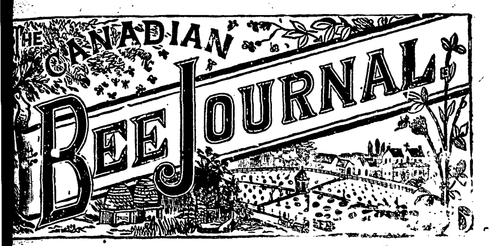
"THE GREATEST POSSIBLE GOOD TO THE GREATEST POSSIBLE NUMBER."