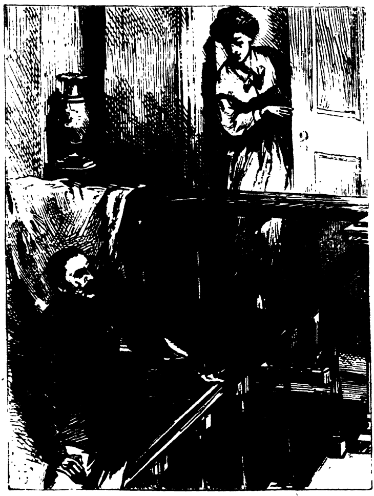
" MIN, IT'S ME!"