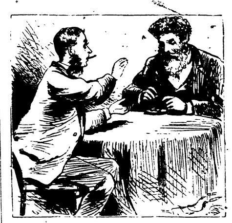
"BY JOVE, I KNEW IT!"

"By Jove, I knew it! And, old fellow, I'm in the same situation."