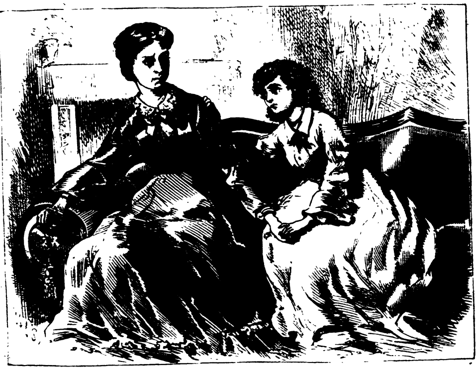
BEE HIM, I'LL LET HIM KNOW WHAT I THINK OF HIM."

fer avoiding him, in your peculiar situation.'