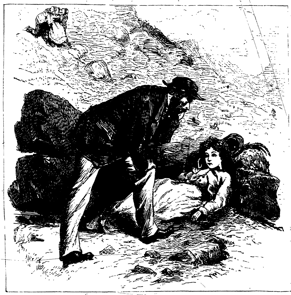
"I BENT DOWN CLOSE."

rub them. I think the motion of carrying her, and the fresh air, had both produced a favorable effect; for I had not rubbed her hands ten minutes when she gave a low sigh. Then I rubbed on, and her lips moved. I bent down close so as to listen, and I heard her say, in a low voice,