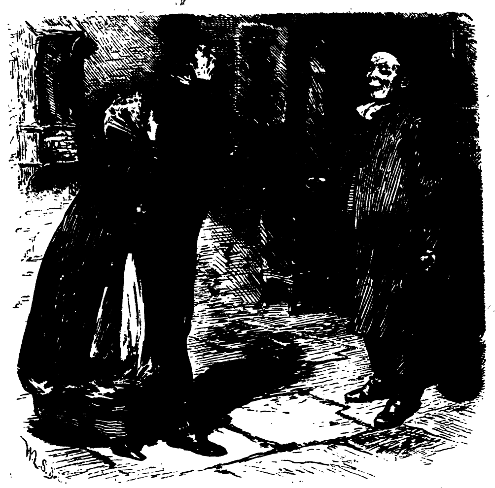
"TONITEUENDUM EST MALUM!"

this moment they came to a turn in the road, when a sight appeared which drew from Ethel an expression of joy.