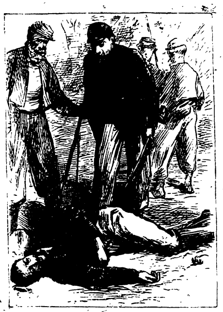
THE DISCOVERY OF A BODY ON THE SHORE OF

length the brigands lost heart, and took to flight. With a wild cheer the assailants followed in pursuit. But the fugitives took to the forest, and were soon beyond the reach of their pursuers in its familiar intricacies, and the victors were summoned back by the sound of the trumpet.