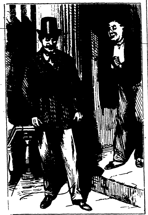
"TO BOME!" HE MUTTERED, BETWEEN HIS SET TRETH."

teeth; and mounting his horse hurriedly, he rode away.