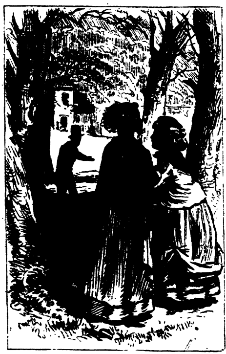
A RUINED MOUSE."

In a few minutes two men came up to Hawbury, and led him away to the woods on the left.