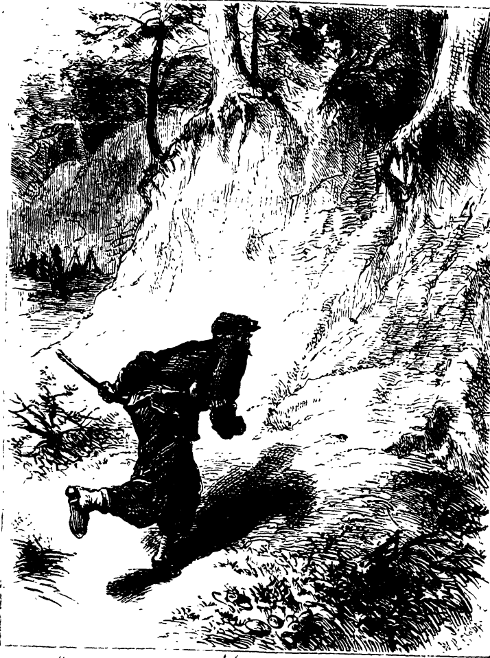
"HE GAVE A LOUD CRY OF JOY, AND THEN SPRANG UP THE BANK."

He gave a loud cry of joy, and then sprang and he wasn't a Roman Catholic clergyman at up the bank