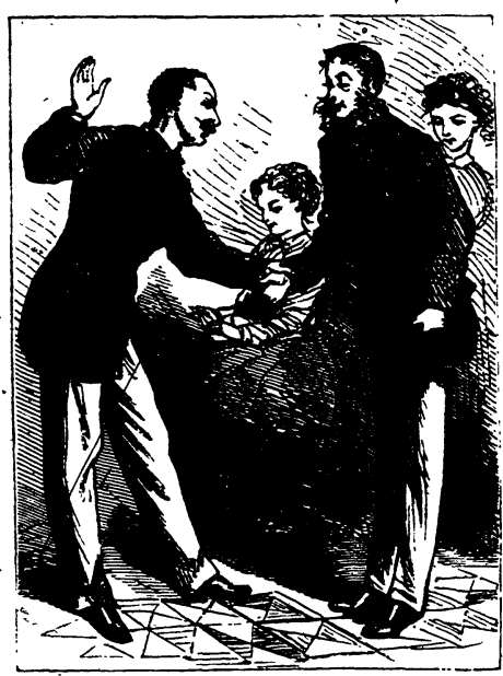
"HAWBURY, AS I'M A LIVING SINNER!"