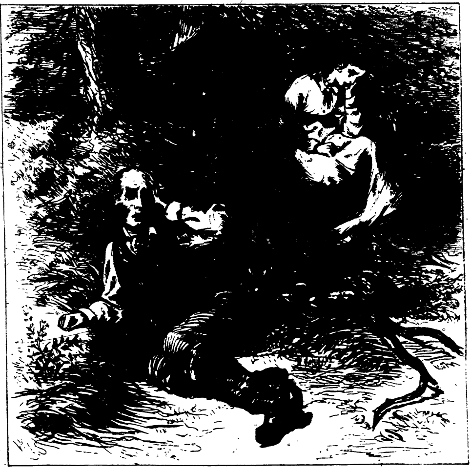
"ALL GONE; MY ETEBROWS, AND MUSTACHE, AND EVERY WISP OF HATE FROM MY HEAL."

taken place on the preceding day. It was now about the middle of the next day. You may imagine how confounded I was at that.