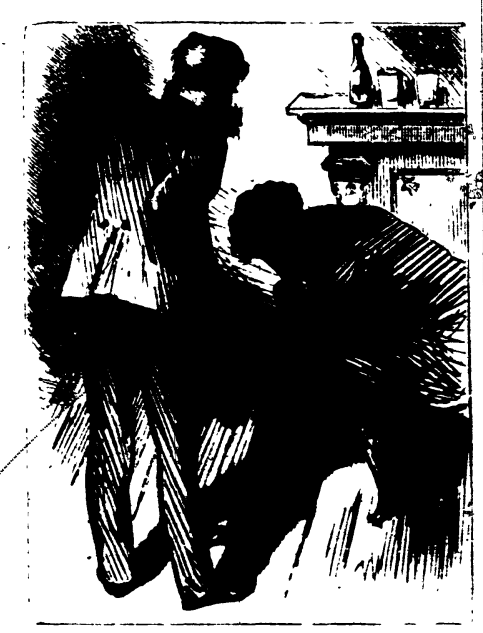
" HALLO, OLD MAN, WHAT'S