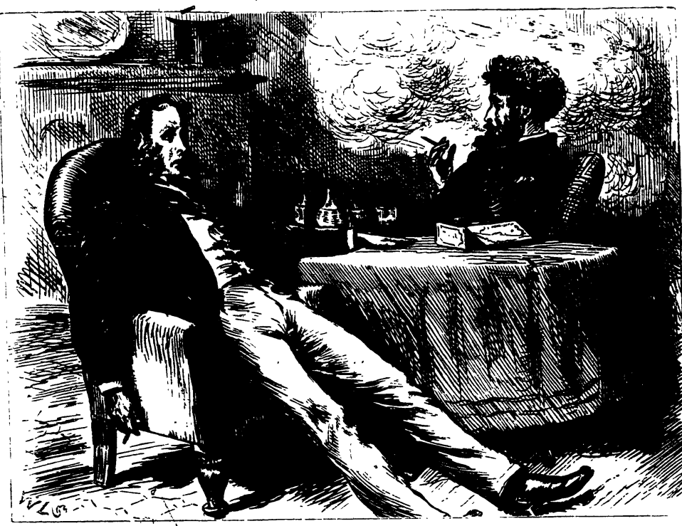
"HAWBURY SANK BACK IN HIS SEAT, OVERWHELMED."

you'll overlook this little outburst, won't you? In South America I was always cool, and you did the hard swearing, my boy. I'll be cool again; and what's more, I'll get back to South America again as soon as I can. Once on the pampas, and I'll be a man again. I tell you what it is, I'll start to-morrow. What do you say? Come."