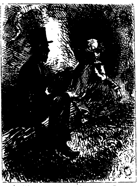
" ' WORSE AND WORSE,' SAID TOZER."

much as a mile from the house. The cliff was almost fifty feet high, and was perpendicular. All around was the thick forest, and it was unlikely that such a place could be discovered.