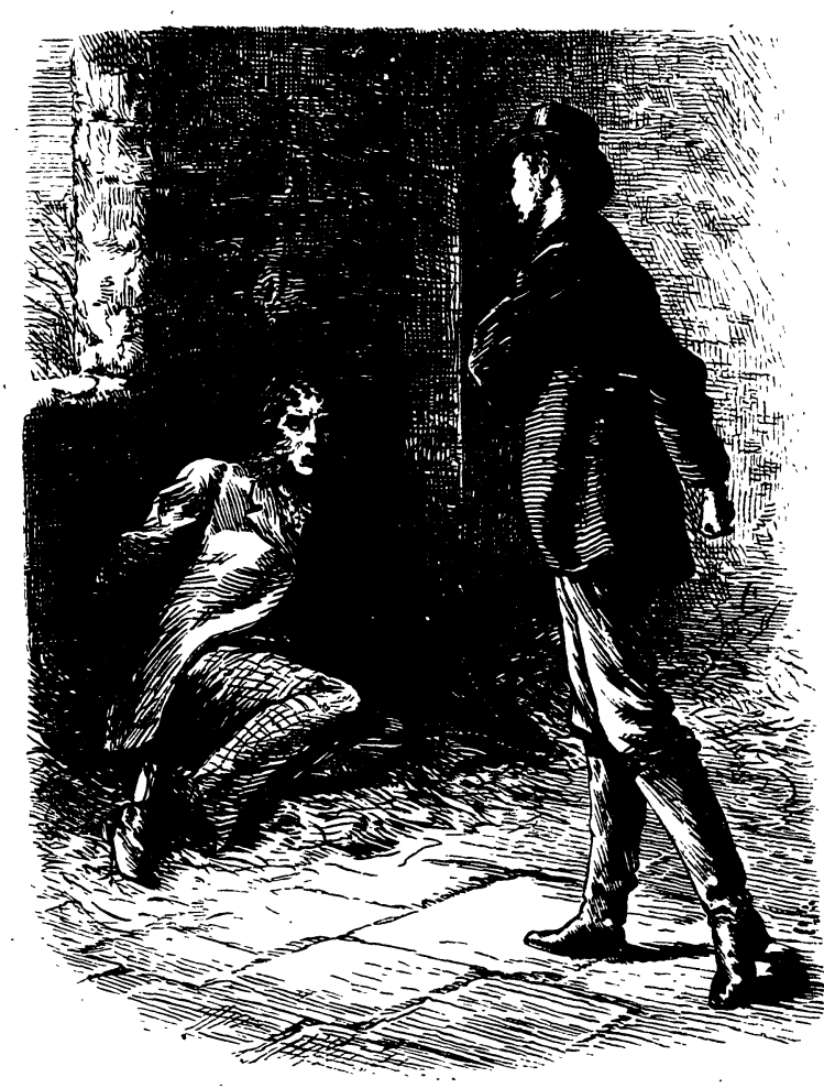
"INGLIS MILOR, I SALL HAF YOUAIR LIFE."

glitter in his eyes, "I sall haf youair life—wis de pistol, but not in de duello. I sall blow your brain out myself."