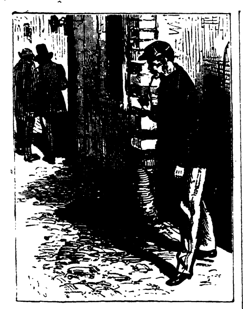
"I WATCHED HIM."