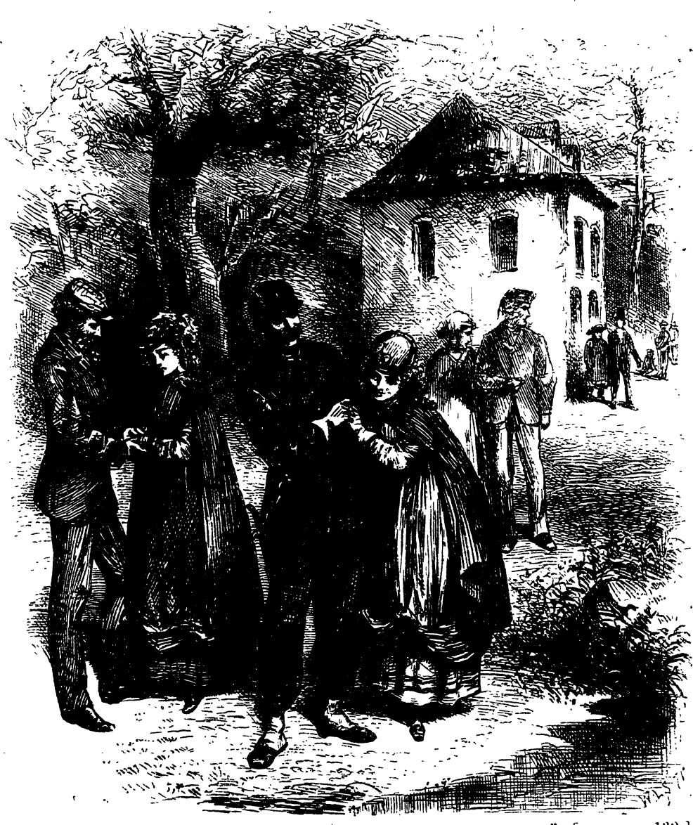
"AND AS THEY STOOD THE CLERGYMEN SLOWLY CAME OUT OF THE HOUSE."—[SEE PAGE 132.]