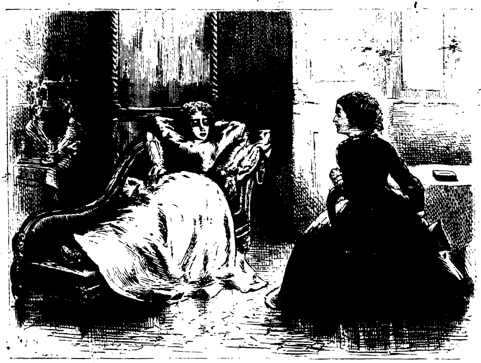
44 ANOTHER MAN !?

side, and her delicate hands gently clasped in ! front of her.