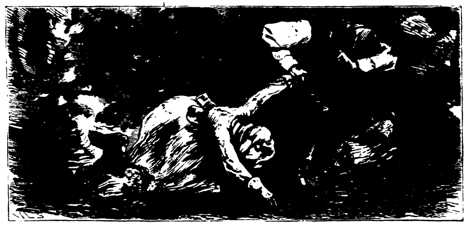
THE FIERY TRIAL

ments that I endured from trying to breathe. Besides this, the enormous effort of keeping up a run made breathing all the more difficult. A feeling of despair came over me. Already we had gone half the distance, but at that moment the space seemed lengthened out interminably, and I looked in horror at the rest of the way, with a feeling of the utter impossibility of traversing it.