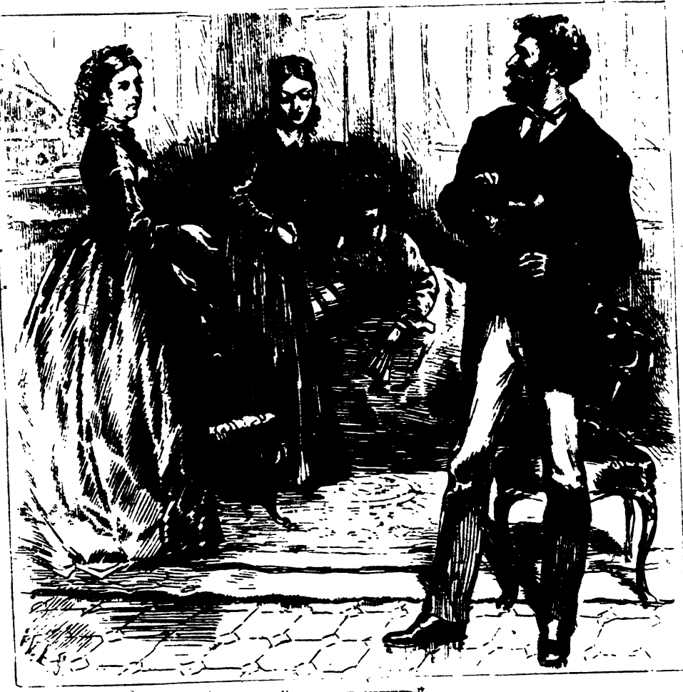
"I STOOD TRANSFIXER"

confronted her. She looked at me calmly, and then stood as though expecting to be introduced. There was no emotion visible whatever. She was prepared for it: I was not: and so she was as cool as when I saw her last, and, what is more, just as young and beautiful." "The devil!" cried Hawbury.