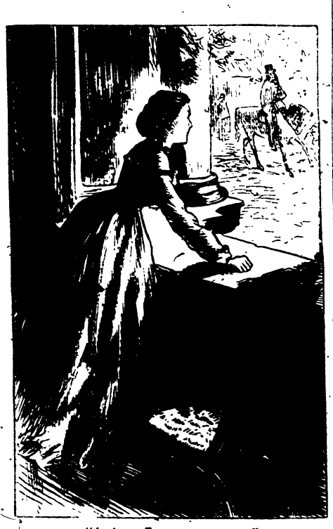
"T'S HE! SHE MURMURED."

"Great bore, old fellow," said he; "but I did it. The old lady is an old acquaintance, you know. I'm going there to-morrow again. Didn't see any thing to-day of the child-angel. But it's no end of a bore, you know."