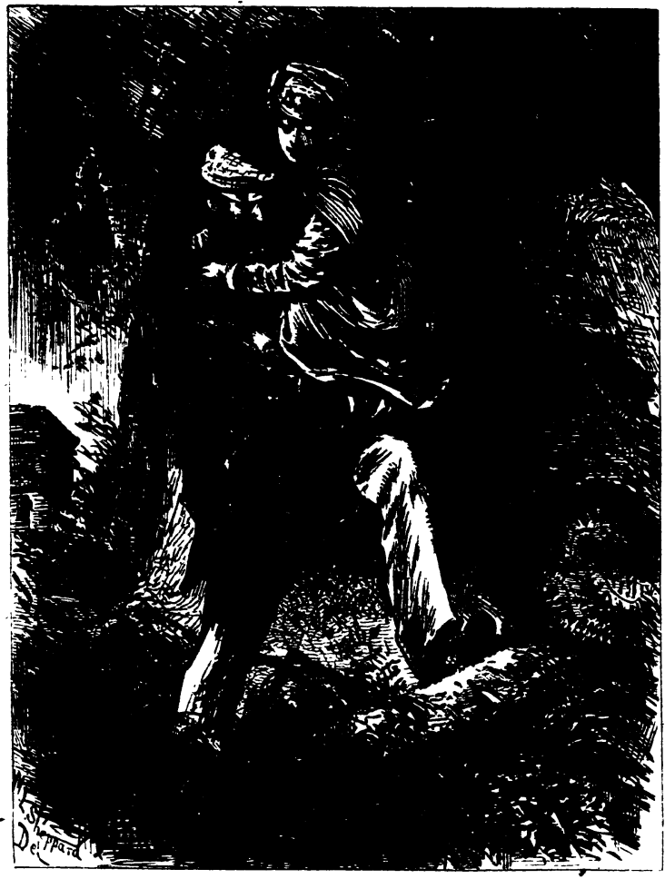
"AT THIS DACRES BUSHED ON FASTER."

At this Dacres rushed on faster. The effort was tremendous. He leaped over fallen timbers, he burst through the underbrush.