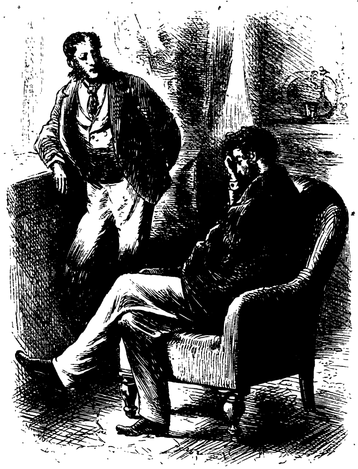
"HE BENT HIS READ DOWN, AND RAN HIS HAND THROUGH HIS BUSHY HAIR."

world. I'm afraid to stop in Italy, and I'm way, when Dacres entered, quite unceremoniafraid to go back to England. Then I'm always afraid of that dreadful American. I suppose it's no use for me to go to the Holy Land, or Egypt, or Australia; for then my life would be saved by an Arab, or a New Zealander. And oh, Kitty, wouldn't it be dreadful to have some Arab proposing to me, or a Hindu! what am I to do?"