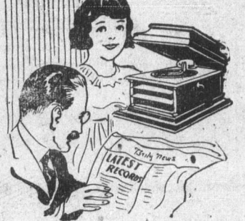
DO YOU LIKE JAZZ?

Miller's Worm Powders act Miller's Worm Powders act so thoroughly that stomachic and intestinal worms pass from the child without being noticed and without inconvenience to the sufferer. They are painless and nerfect in action, and at all times will be found a healthy medicine, strengthening the stomach and maintaining it in vigorous operation, so that becides being an effective vermifuge, they are tonical and health-giving in their tonical and health-giving in their effects