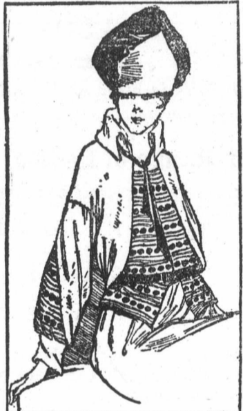
The Blouse Coatee.

Take for example the exquisite little blouse-coatee shown in the sketch. This is one of Beer's latest models and it is expressed in putty-colored pout