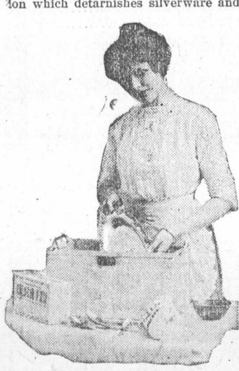
THE NEW CLEANER

The apparatus consists of an ordinary vessel made of sheet bottom of which is soldered a grating, made of tinned iron wires. The solution, one tablespoonful of baking soda and one tablespoonful of ordinary table salt dissolved in water and poured into the pan, generates a galvanic acdon which detarnishes silverware and