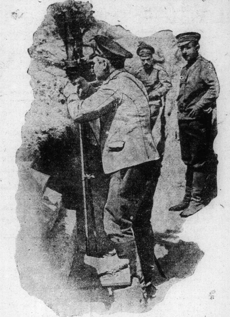
The Russian artillery, handicapped as it has been in many ways, is now said to be gradually proving its worth in battle, especially the work of the observer. This picture, which describes the observer at work, shows an officer using a range finder in the trenches.