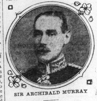
SIR ARCHIBALD MURRAY Sir Archibald Murray has been appointed to succeed Sir Charles Monro as British commander at the Dardanelles.