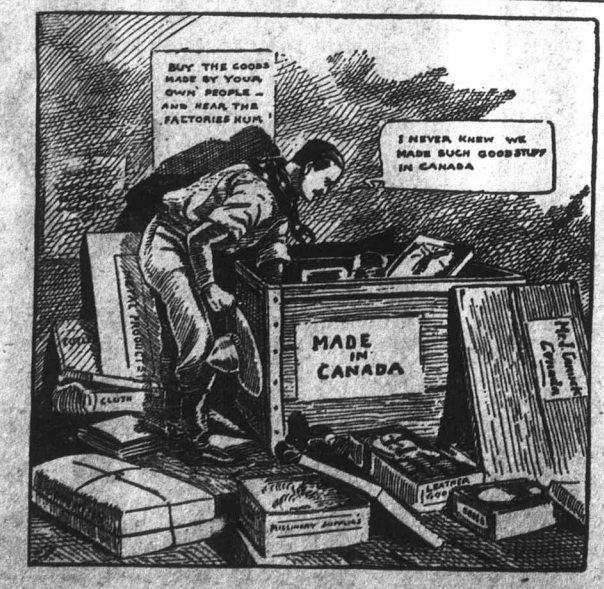
A DISCOVERY. HAVE YOU MADE IT?

ment's financial plans, and voted on the spot slightly more than $1,500,000 (United States currency) in subcriptions for the National Domestic Loan. Now, if that had happened in New York, in Boston