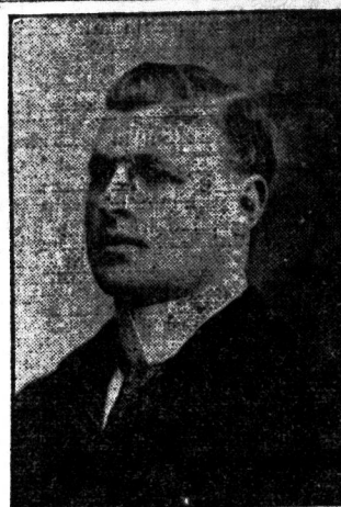
HUGH GUTHRIE. M. P. for Wellington, who made a powerful defence of reciprocity before West Middlesex Liberals yesterday.

Minimum and maximum temperatures: London, 35-50; Dawson, 14-20; Prince Rupert, 20-40; Victoria, 30-40; Calgary, 30 below-12; Edmonton, 14 below-24; Prince Albert, 12-20; Winnipeg, 16-32; Qu'Appelle, 18-29; Pelly, 10-20; Port Arthur, 16-26; Pelly Sound, 20-38; Toronto, 35-50; Ottawa, 30-40; Quebec, 4-25; St. John, 20-35; Halifax, 25-30.