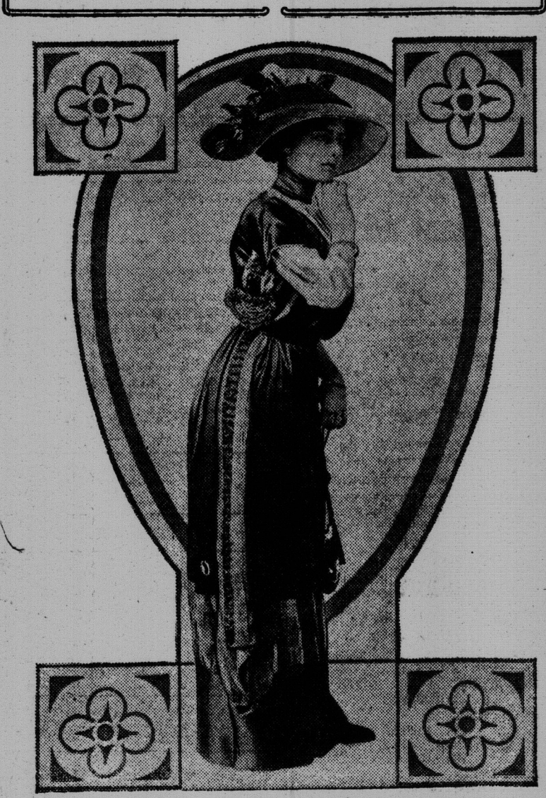
BRIDGE PROCK OF SATIN CHARMEUSE Illustrated is an afternoon costume for whatever except that which is supplied indoors, or with a wrap for street, made by the two color tones and two weights by Cheruit, and typical of the simple effects in materials. On the giraffe there is a facts so much in favor of high-chance rosette ornament of chiffon veiled with dresses. The material is satin charmeuse brown chiffon. The hat has a new and in dark seal brown, combined with gray marked feature in the champagne, or and brown chiffon. There is no trimming; high bandeau, at the back.