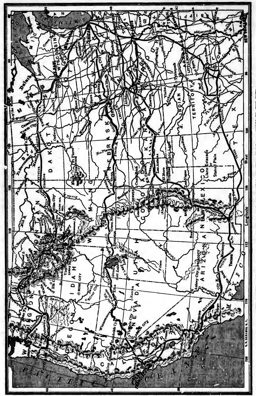
THE WESTERN STATES AND THE TERRITORIES OF THE UNITED STATES. SCALE, 250 MILES TO THE INCH.