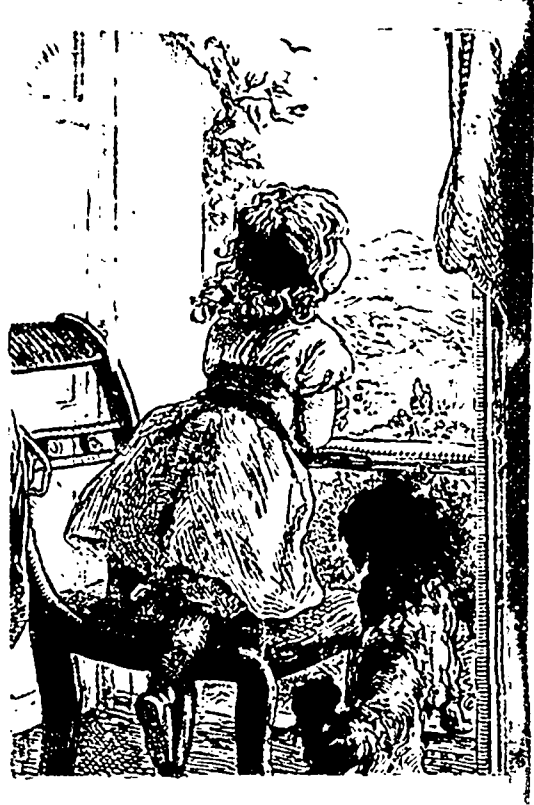
THE GOLD DISH AND THE RAINBOW.

Her mother replied to her thus: "There is no doubt, my child, but that there is a heavenly jewel of so much value that all the wealth of earth may not be compared with it. The children who are to share