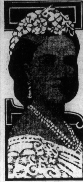
CHARLOTTE, Ex-Empress of Mexico, who is reported dying.