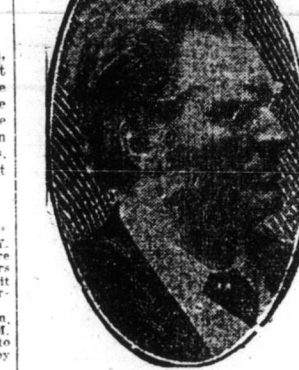
BJORNSTJERNE BJORNSON, Who is reported ill.

Fifty Italian strike-breakers were taken to the mills to-day under a strong police guard.