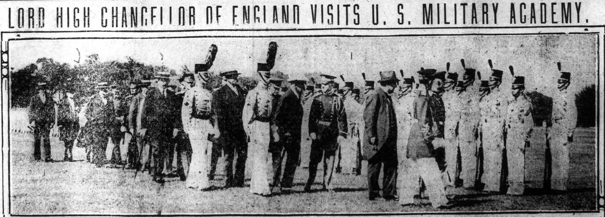
INSPECTION OF CADETS BY THE CHANCELLOR. Viscount Haldane, Lord High Chancellor of England, beheld the West Point of his dreams. He had known the United States Military Academy only through his studies when Secretary of State for Great Britain...