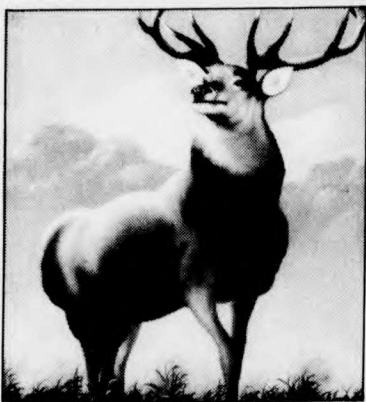
by Ron Howe

Killdozer Twelve Point Buck Touch and Go Records