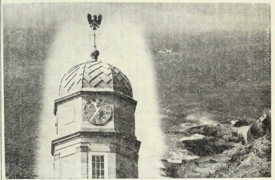
"All hail to thee, Dalhousie,

Fundamentally, this group is no different from any other that has come here in the past several years. It is marked with diversified interests, different tastes and individual educational desires. It is, however, a group with one fundamental, common characteristic: Each individual possesses a basic educational background that has been obtained during the past several years at high school.