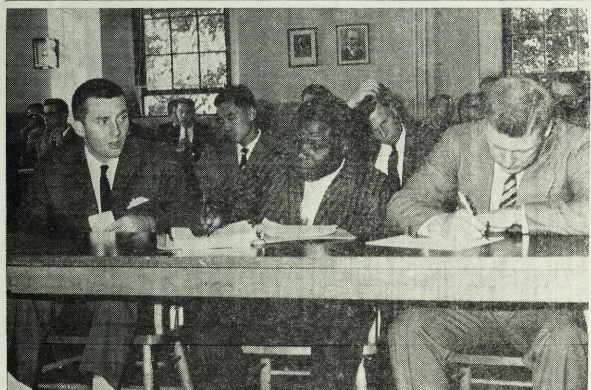
A typical lecture room scene. Note the various types of student. The feverish note taker, the head scratcher, the man with the blank stare. Which one will be you?

1500 for the coming season, and has suggested that the yearbook be made compulsory to all undergraduates, thereby lower-ing greatly the retail cost to students. Those interested in becoming members of PHAROS should see the editor as soon as possible. They too will be able to turn their efforts towards producing a yearbook whose quality is rarely equalled among