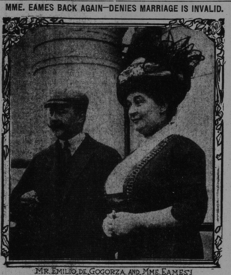
MR. EMILIO DE GOGORZA AND MME. EAMES. Mr. Emilio Gogorza and his wife, who was Mme. Emma Eames, and famed as an operatic star, are shown above as they appeared on their arrival in New York from abroad.

AFTER THE BATTLE. The Times new reporter knocked himself in at the editor's door this morning.