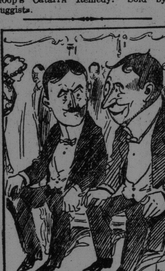
Mrs. Landlary—Mr. De Broke, have you any idea of the size of your bill? Mr. De Broke (despairingly)—Haven't I? Why, I dreamt for three nights in suc-