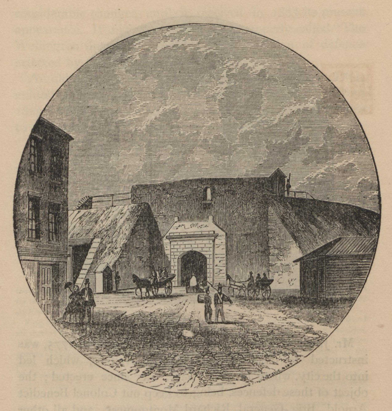
ST. JOHN'S GATE, DEMOLISHED, 1869.

the English War Office, put up at a cost of $40,000. All it now quires is a statue of the founder of the city, to crown this elegant structure.