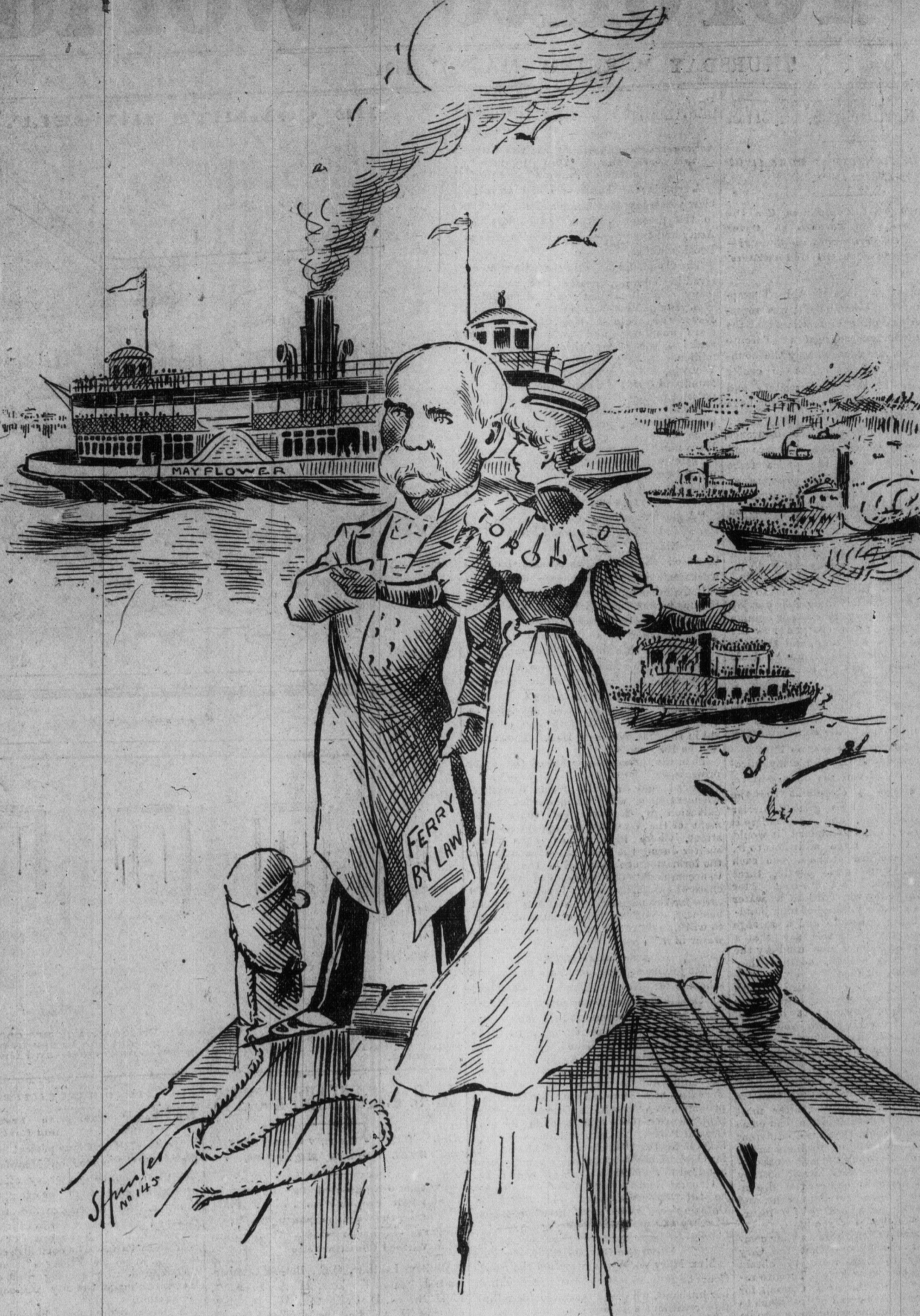
TORONTO: My choice, Mr. Mayor, is the old Bylaw and the present large, splendidly equipped Ferry Boats. If you change the system you fill the Bay with small boats which keel over on their sides and spread panic among the people, and you render rowing and sailing a positive danger instead of a pleasure.