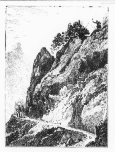
. TRIBETAN BOORY TRAP.