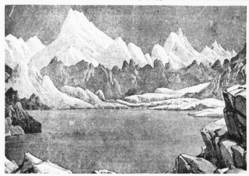
THE CHOLA PASS AND LAKE, WITH MOUNT KINCHINJUNGA,

Sometimes traveling was so dangerous on account of brigands that the excott dared not stop, and traveling went on day and night. On the return journey a strong man, a Thibetan, died from the effects of a cold, and Miss Taylor herself at great altitudes had repeated attacks of palpitation Cooking, when there was anything to cook, was most difficult, as the water hoiled with so little heat. Frequently pieces of ice put in to replenish the pan, floated in hoiling water some time before melting. Once she was twenty nights in the open air sleeping on the ground, snow falling all the time, as neither tent nor house was to be found. The horses were almost starved, the snow covering everything. The poor animals are even woollen clothing when they got the chance. A small ration of cheese mixed with