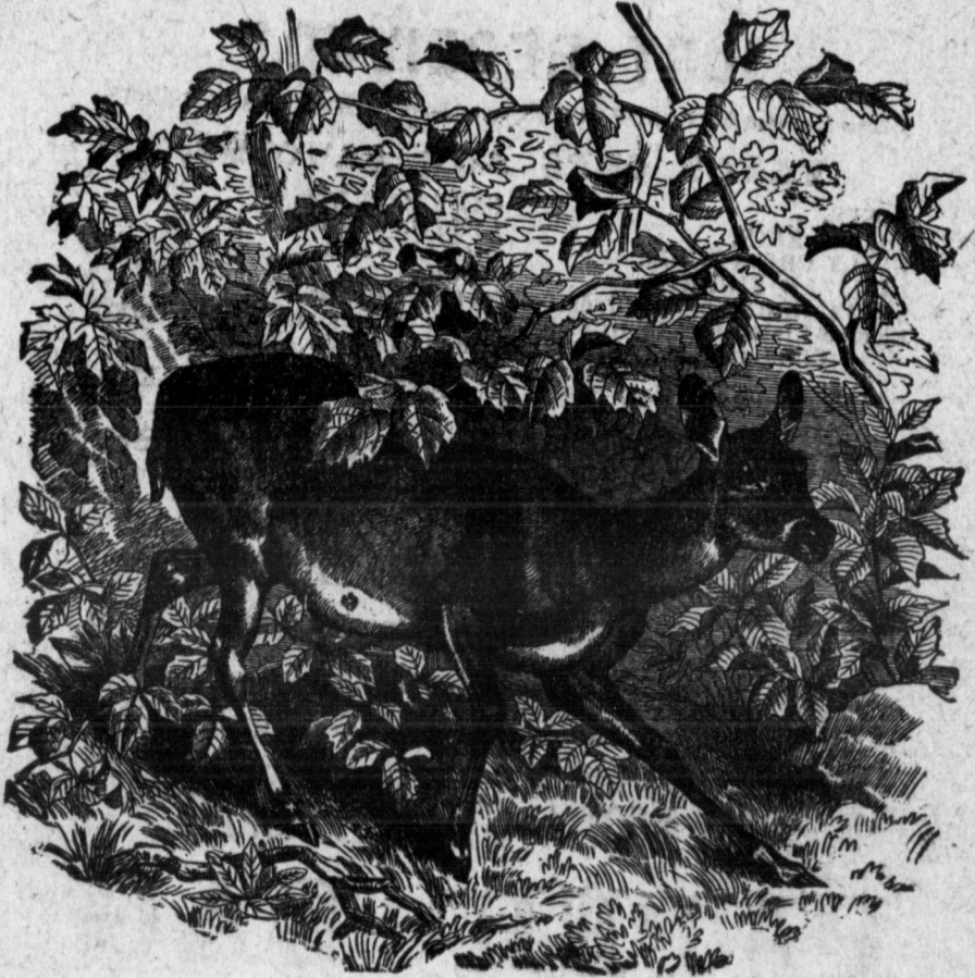
THE STARTLED FAWN.