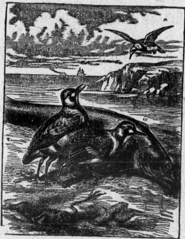
A ROYAL BANQUET.

cutlass, and a hard fight seemed at hand, when suddenly a cry of dismay resounded along the Dutchman's decks. Their flag had disappeared from the masthead!—their ship, no one knew how, had struck her colors! Before they could recover from their bewilderment, the English boarders came leaping on. That moment of indecision was fatal to the Dutch. Taken by surprise, the few who attempted resistance were beaten down, the rest gave way in despair, and the ship was captured. But how had the flag been brought down? Not by the Dutch themselves, for their first officer (the captain having been disabled) declared that he had never thought of surrendering. Not by a shot, certainly, for the top-gallant and royal-masts were still sound. Every one was puzzled; and when a sailor, who had gone up to look, reported that the halyards had been cut with a knife, they were all more puzzled than ever.