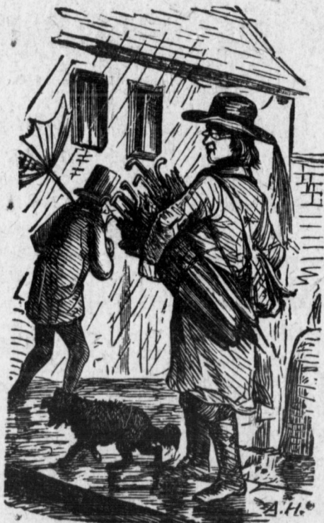
A BEAUTIFUL DAY FOR SALES.