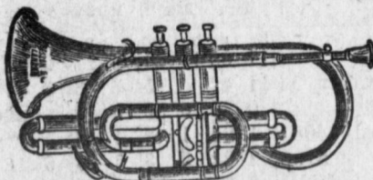
A Fine B Flat Cornet, with Water Keys, Case, &c., for $20. Without Water Keys, $13, $15, &c.

Pianos, Organs, Band Instruments, Music Stands, Piano Stools, Sheet Music, Music Books, Violins, Accordions, Violin and Guitar Strings, &c. &c. PIANOS AND ORGANS by leading AMERICAN and CANADIAN makers kept in stock. WRITE FOR PRICES. Address—