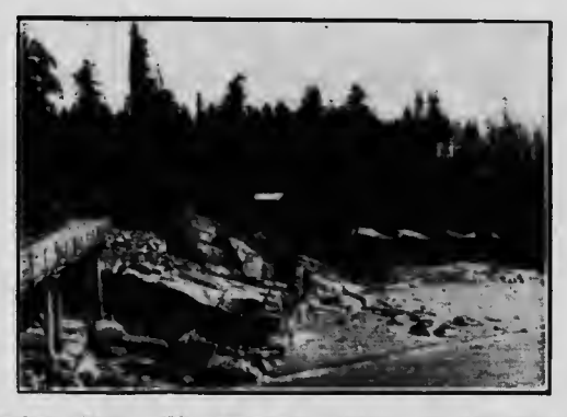
Selma Park: The Summer Resort of the Coast

3 to 4 Hrs. From Vancouver Selma Park This ideally situated summer and resort, operated by the Union Sechelt Steamship Company, is most suitable as a centre for the sportsman who wishes to be within easy reach of the with City. Consisting of a number of cottages and bungalows which may be hired by the month; it is within a short Half distance of Sechelt, holding a high Moon Bay place in popular esteem for charm. convenience and accommodation.