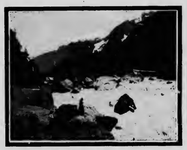
Kimsquit: The Mome of Pin and Pur.