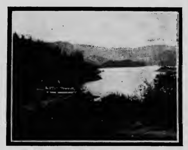
Pender Marbour: Ideal for Sport and Pleasure.