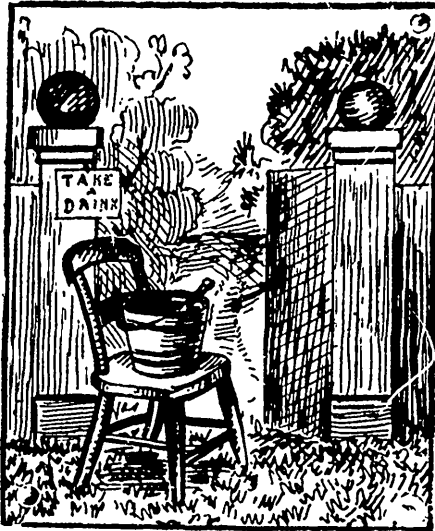
TAKE A DRINK AND WELCOME.