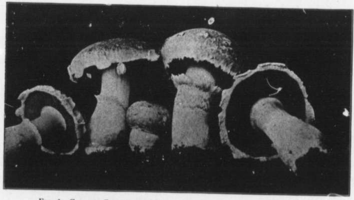
Fig. 1-Common Cultivated Mushroom. (Agaricus campestris, Linn.)

tinge of brown. The stipe is nearly solid or somewhat spongy within, from ½ to ½ inches thick and 2 to 4 inches long. When the mushroom is young, the gills are hidden by a veil which stretches from the edge of the cap to the stipe. When the mushroom expands this veil is broken from the edge of the cap and forms a ring on the stem. The plant grows in fields and lawns.