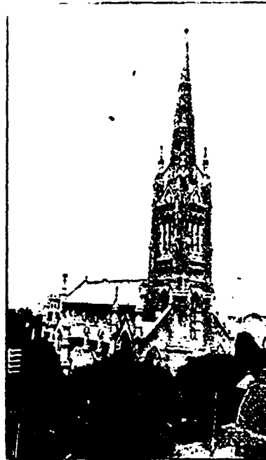
St. James' Cathedral, Toronto.

This is the lesson for those in authority. And for those under authority there is a lesson quite as obvious. What answer shall we make in the Great Day, if in this life we spend all we have of time, and talent, and money, on ourselves, and let the cause of our most holy Redeemer languish and die for lack of our aid; if we gratify every whim and enjoy every pleasure, but leave the soldier of the Cross, who calls upon us for assistance, and has himself gone forward at God's bidding, unsupported; if, while we have made ourselves comfortable and fulfilled every requirement of fashion and of folly, we have not provided means for the Church to spend its leavening influence throughout the land? And this is a series of questions affecting not only God's people in older Canada, but also ourselves even here in Algoma! Indeed, it seems to me that the questions suggested press first and foremost, and with peculiar force, upon us. For, if we at home have not done our duty, how can we blame those who are far away? And the death of our great