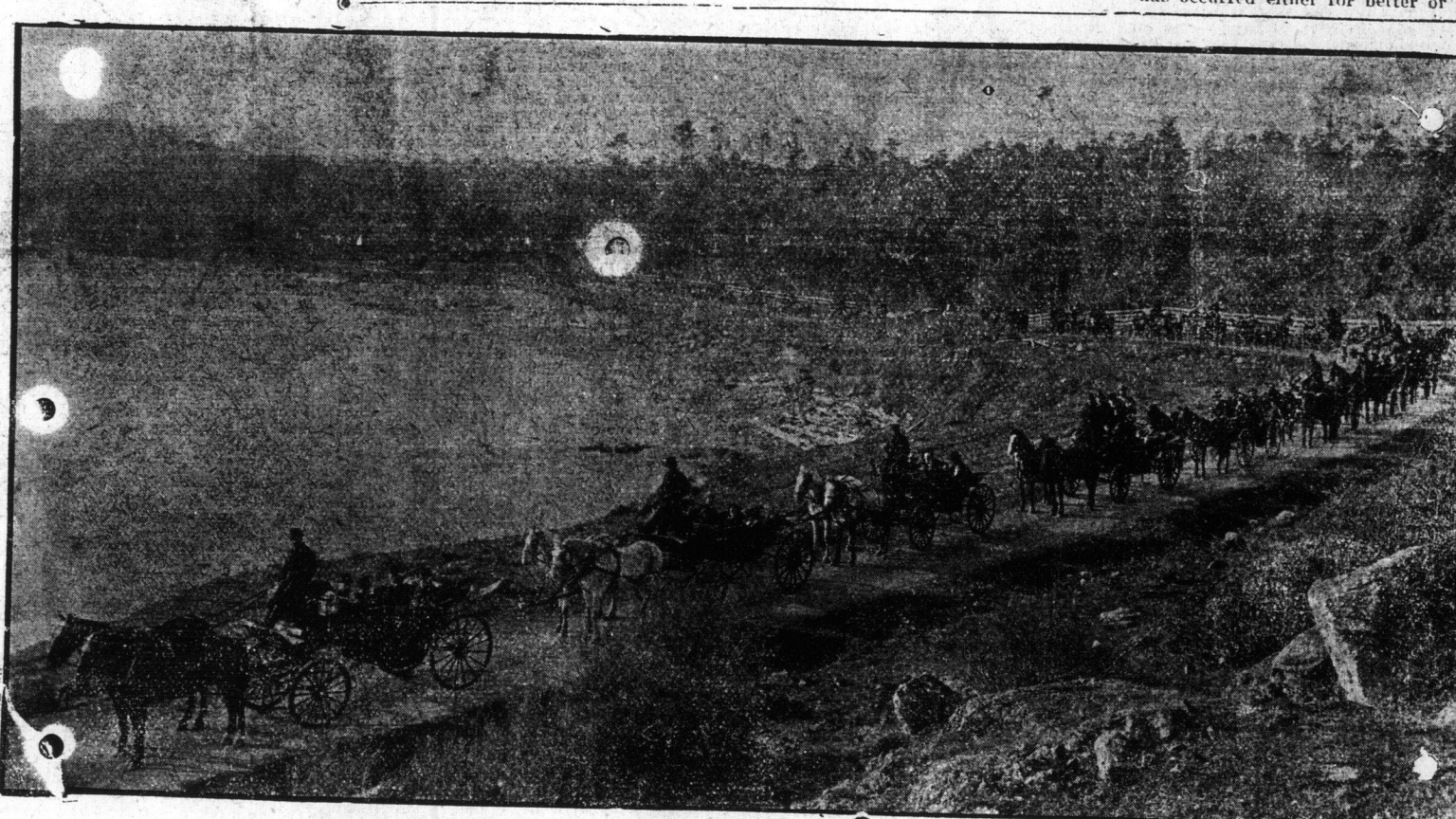
THE DELEGATES ENJOY AN OUTING AT FOUL BAY.

should lie in this state for this length of time would not cause much surprise, but for the three men to all be affected