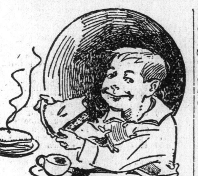
Figure the Good

That we do for you. See the big benefit of dealing with us. Think carefully—act wisely, and reap the reward. Our effort is for your benefit. Our offerings prove a ray of bright attractiveness in the goom of moneyspending. The good is yours because you get every possible advantage. FRESH RHUBARB, 2 lbs. FRESH LETTUCE, head .. THREE STAR FLOUR, sack .......$1.10 DRIFTED SNOW FLOUR, sack ... MAKES THE FINEST PASTRY