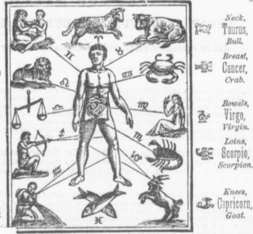
The Feet, * Pisces, The Fishes.