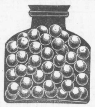
From the " MEDICAL GAZETTE.

At the request of many friends, we have recently had the proprietary medicine known as Bristol's Sugar-coated Pills analyzed, and are now prepared to speak of them understandingly. The analysis proves the following: