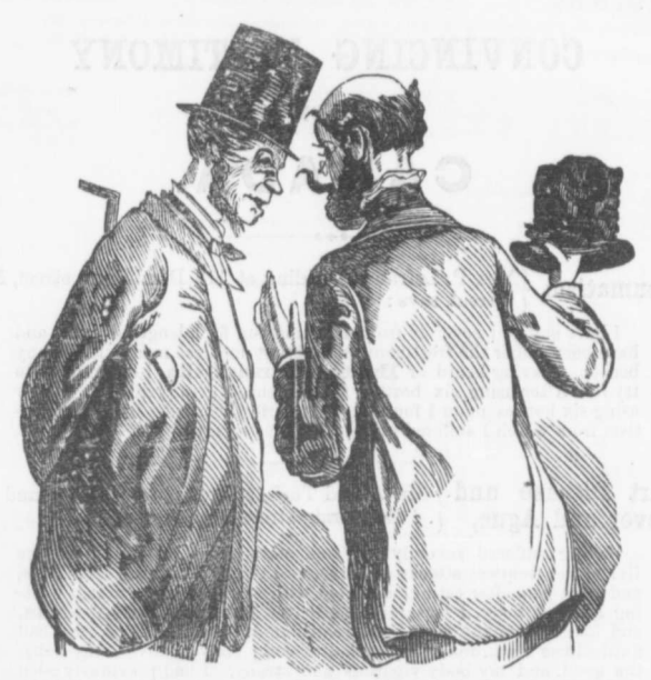
A REASON.—"My dear sir, do tell me why you wear that shocking bad hat?" "Nothing simpler—my wife has vowed she will never go out with me until I get a better,"

OLD sores that have defied all treatment for years are quickly and safely healed by Bristol's Sarsaparilla.