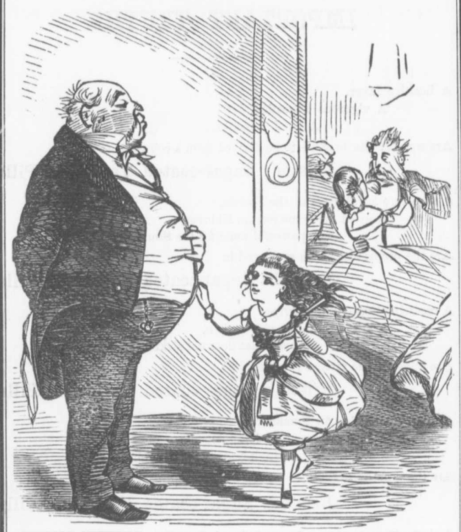
EXCITED JUVENILE.—" Oh, uncle dear, do dance with me, it's only a gallop!"