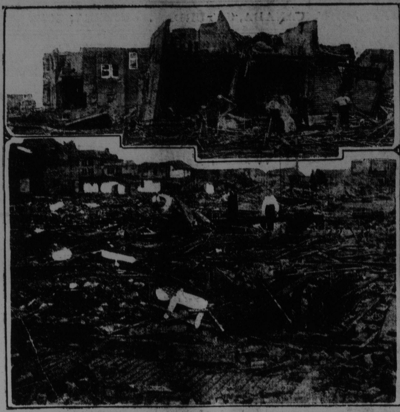
TOP PICTURE SHOWS RUINS AT LORNE STREET AND 13TH AVENUE. THE TORNADO DID ITS WORST WORK IN REGINA'S SWEST RESIDENTIAL DISTRICT WHERE THE LOWER PHOTOGRAPH WAS TAKEN. THIS SHOWS RUINS ON SMITH STREET.