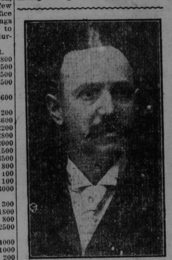
MAYOR MCLEAN, SUSSEX.

Efforts of Energetic Townspeople Bearing Fruit In Material Progress of Centre---Agriculture Forges Ahead.