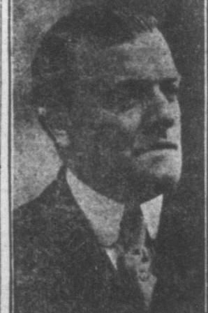
PRES. CHAS. C. SHAY.

The Trades and Labor Council of Mrose Jaw refused to Indorse a resolution at the Calgary Labor conference favoring a five-day week and a six-hour day by a vote of nine to five. The One Big Union proposal/was discussed, but no definite action was taken.