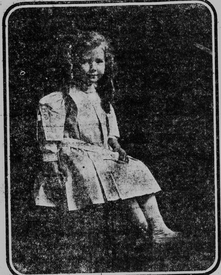
THE MUCH-FAVORED JUMPER