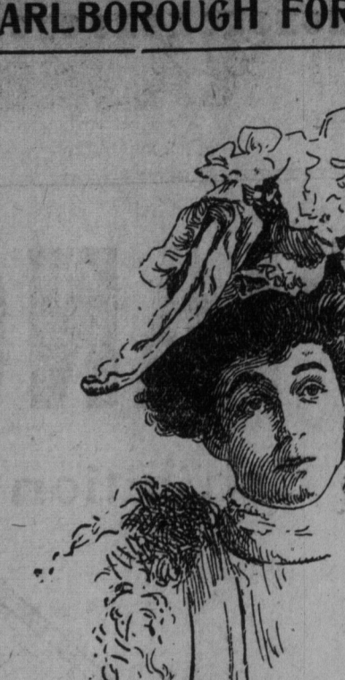
The Duchess of Marlborough.

Full and complete turt returns from all American and Canadian tracks in The Toronto Sunday World.