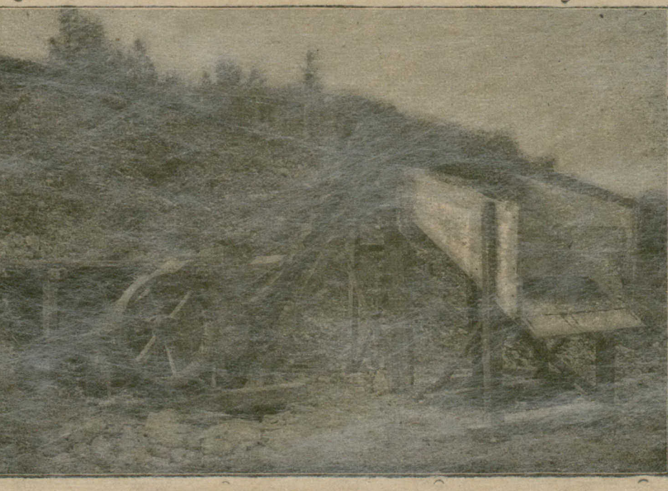
STONE CRUSHER, WITH ROTARY SCREEN ATTACHED.

"Iron plates, 12 inches in width, were laid on several miles of streets in London, England, more than fifty years ago. The object of this was to reduce the traction for very heavytraffic between the docks. The iron plates were