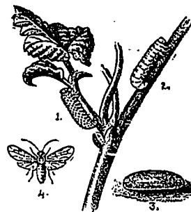
1 and 2. Larva in the two last stages. 3. The Cocoon. 4. The Fly.

The Gooseberry Saw-fly is very troublesome in gooseberry plantations and gardens in some seasons. It also attacks red currant bushes, but not so frequently as gooseberry bushes. In many