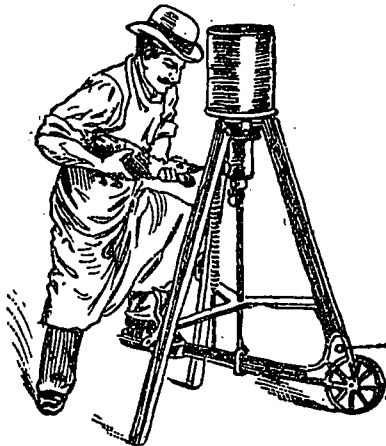
A man at the machine.