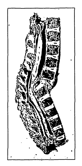
FIG. 1. SAGITTAL SECTION.

but in every museum there are specimens which illustrate the fibrous method of union. This means that unless proper measures be undertaken the kyphosis of Pott's disease may keep on increasing long after the tuberculosis is cured, owing to the bowing of the spine at its point of greatest weakness. The obvious prophylaxis of this condition is to have the patient wear a spinal support of some sort for many years after the disease has subsided, and in cases in which there is a marked kyphosis it is well to have him look forward to always wearing this support. A view of the cut surface of the