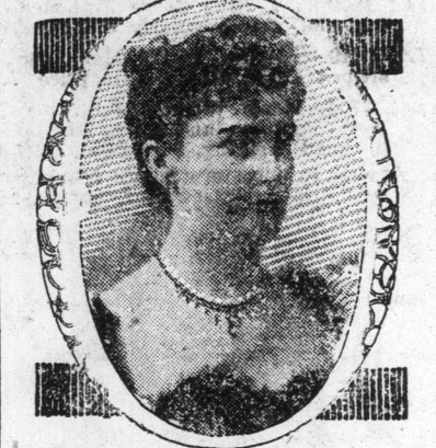
THE LATE QUEEN OF SERBIA.