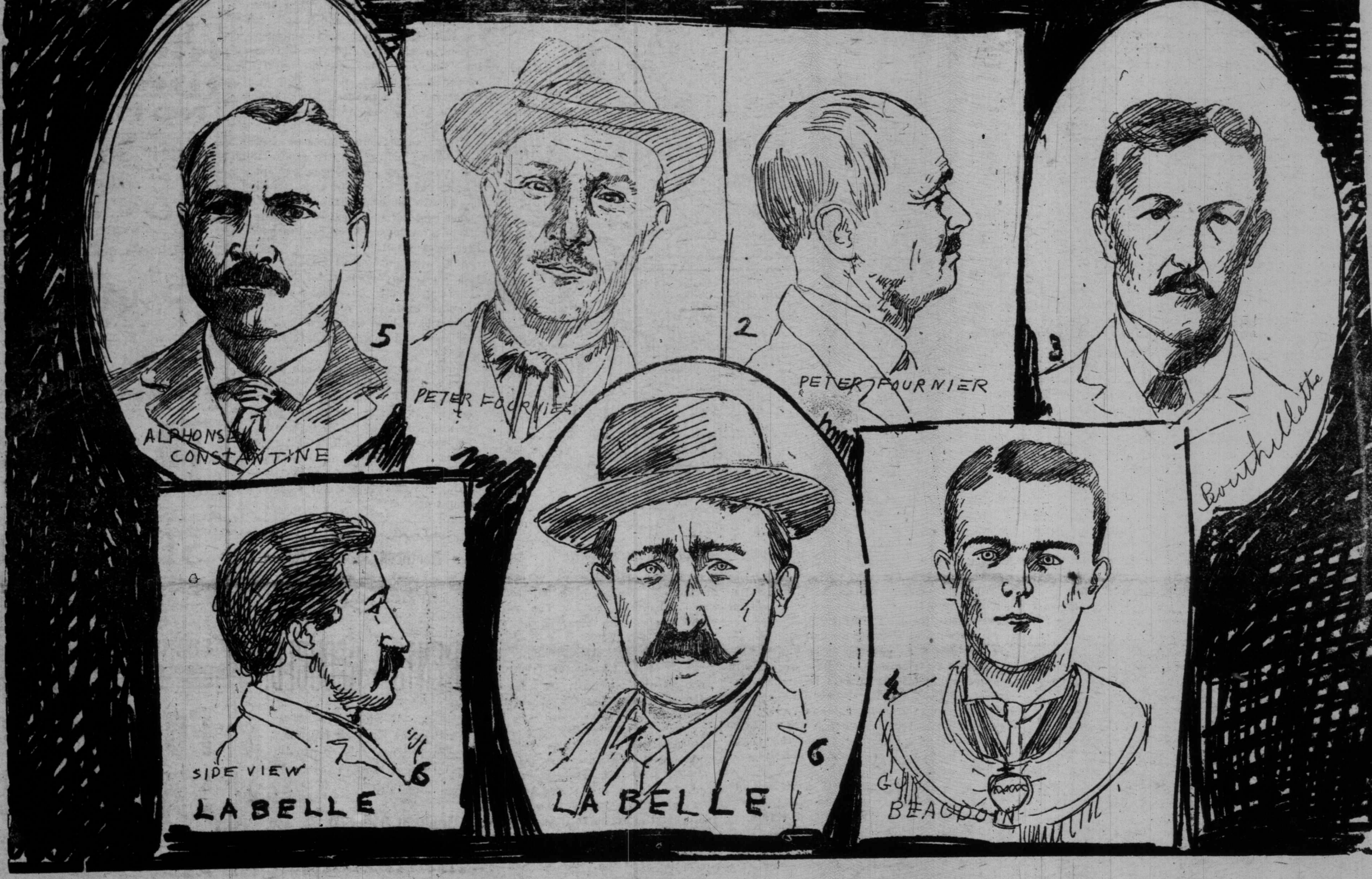
THE VICTIMS OF THE LATEST YUKON TRAGEDY AND THE MEN ACCUSED OF THE DEED.

"After making a personal examiation of the ground, I am of opinion that very little damage has as yet been done to the plaintiff's claim; but after hearing the evidence and giving the matter consideration, I consider that in no case should the mining inspector exercise his powers under section 48 of the regulations, unless the applicants for dumping ground can show clearly that it will not in any way increase the expense of the claim owner on whose property the dumping is to take place, in gaining from his claim the gold that it contains. Although very little work has been done on the plaintiff's claim, I am by no means satisfied that he will not suffer by tailings being deposited on the surface of his claim toward the left limit, as the evidence of the value of the ground in question is not conclusive on that point. The rights given a placer miner under his grant must be guarded with jealousy, and I am of opinion that granting the defendants the privilege of dumping on this ground would be an abuse of the powers given under section 48 of the regulations, and deprive the creek claim owner of rights he holds under his grant. The defendant should be restrained from dumping on the plaintiff's claim and I think this is a case where I should not make any