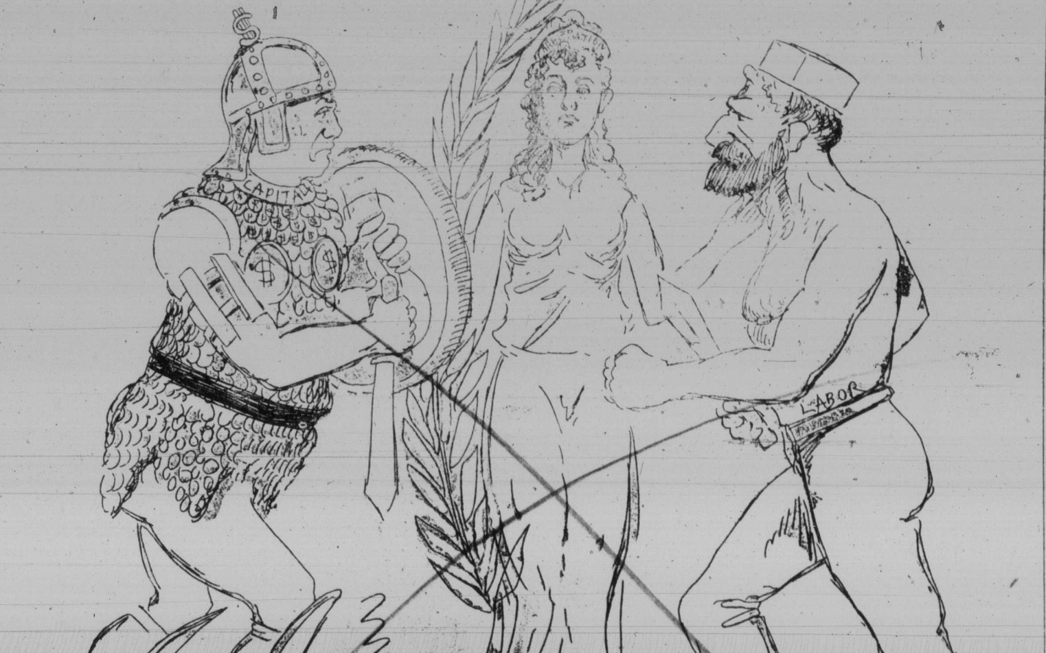
THE DIFFERENCES BETWEEN LABOR AND CAPITAL MUST BE ADJUSTED THROUGH ARBITRATION.