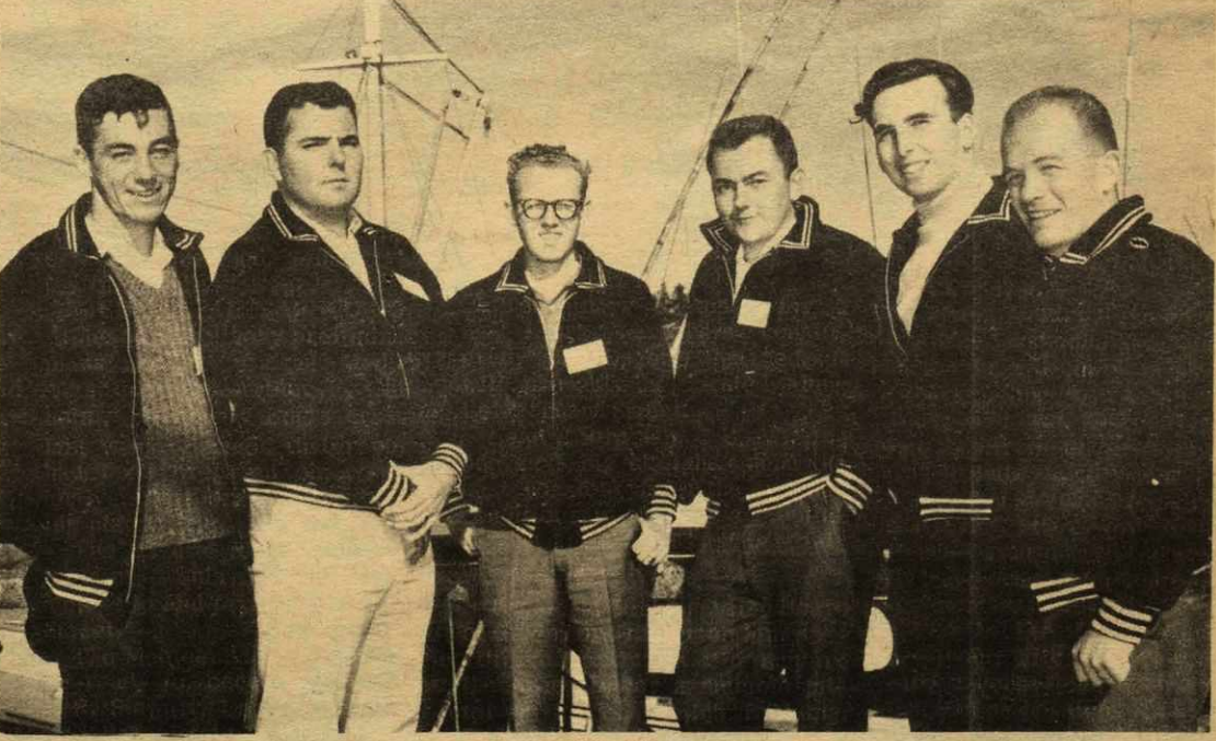
FISHING - Shown above are the members of the fishing team which represented Dalhousie University in the annual Tuna Fishing competition.

U.N.B. 1219; Western Ontario 772; Yale 82; Dartmouth 79; Dalhousie 48; Harvard 45; St. F.X. 21; U. of Mass. 20; U. of Toronto